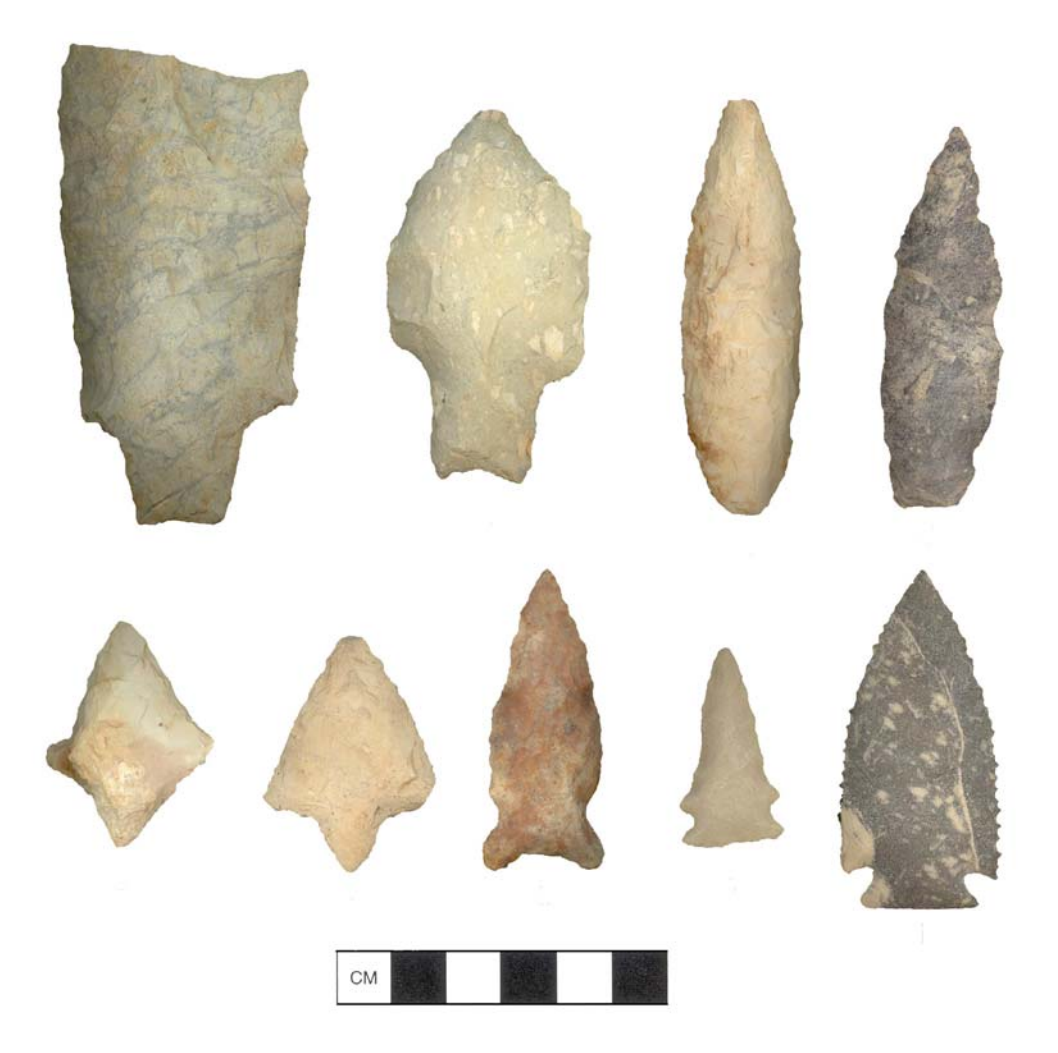
Figure 1.1. Selected diagnostic hafted bifaces, metavolcanic material, Fort Bragg.

surfaces are visible, the macroscopic distinctions among metavolcanic rocks are often subtle. These factors, combined with archaeologists' lack of geological training, make specific rock types hard to identify. What Abbott (2003) terms the "identification problem" has resulted in predominant use of the term "metavolcanic" as an inclusive category for material from the Slate Belt (e.g., Braley 1989; King 1992; Trinkley et al. 1996a).